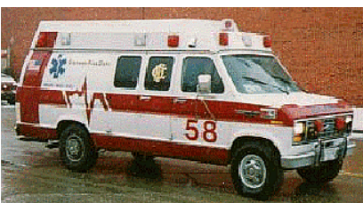
Track Star & Zoll Data Systems RescueNet integration enters field testing.

Track Star is pleased to inform the dealer community that the beta version of our integration with the Zoll Data Systems RescueNet AVL API has entered field testing.